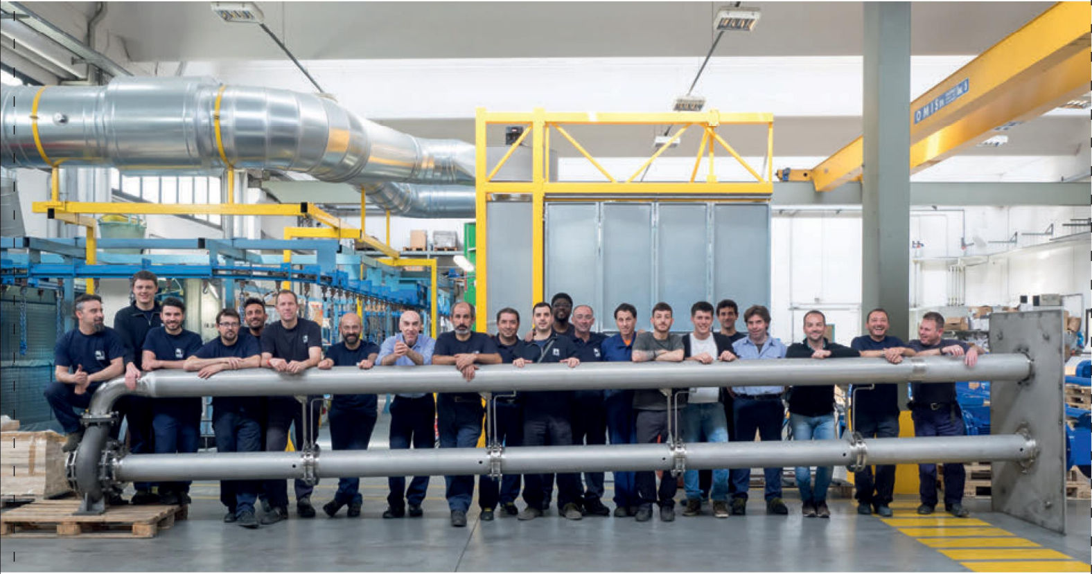
VERTICAL PUMP USED FOR RAW SULFURIC ACID