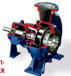
RB PUMP - MULTI-CHANNEL IMPELLER

Pump: RBB 250 35E 4C75 C181 3 Performance: Flow 1000 m 3 /h - head 10 m Liquid: water with oil emulsions.