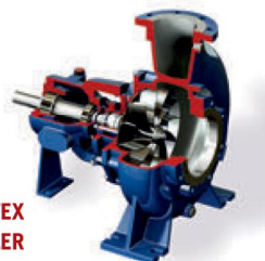
RC PUMP - VORTEX IMPELLER

RCB 100-25A 4C22 C140 3 Performance: Flow 151 m 3 /h - head 22 m Liquid: Viscosity 400 cP - s.g. 1,42