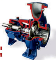
RG PUMP - SEMI OPEN IMPELLER

Pump: RGL 125 25C 2C15 C226 Performance: Flow 160 m 3 /h - head 16 m - NPSH 1,2 m Liquid: salty waste water and crystals. Specific gravity 1,3.